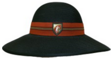
Formal Hat Round Style