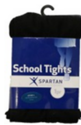
Black Opaque Tights