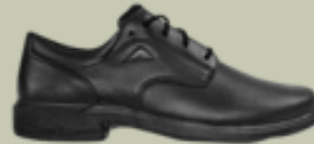
Ascent Scholar Junior/Senior