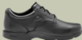
Ascent Apex Junior/Senior