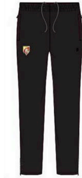
Tracksuit Pants *Only allowed to be worn with sports uniform