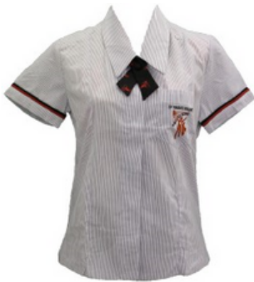
Formal Stripe Blouse