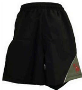
Sport Shorts Long Leg