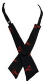
Short Crossover Tie (Seniors only)