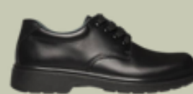
Clarks Daytona Junior/Senior