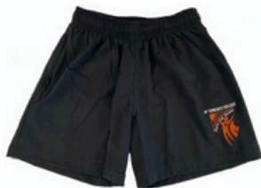
Sports Shorts Short Leg