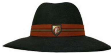
Formal Hat Digger Style