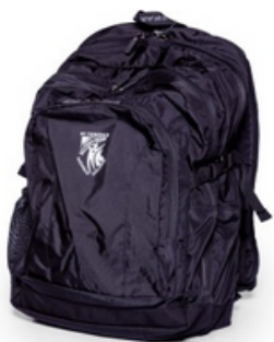
College School Bag