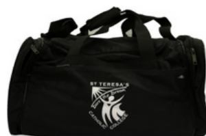
College Sport Bag