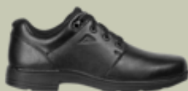
Ascent Prospect Junior

College formal shoes must be black, leather, polishable, school shoes. These shoes are not to be flat soled, but should have a clearly defined sole and heel resembling a traditional school shoe. No runners, desert boots, suede, ballet type shoes, high tongues, platforms, high rollers, skate shoes, deck shoes, Converse, Vans or any other fashion canvas shoes are permitted.