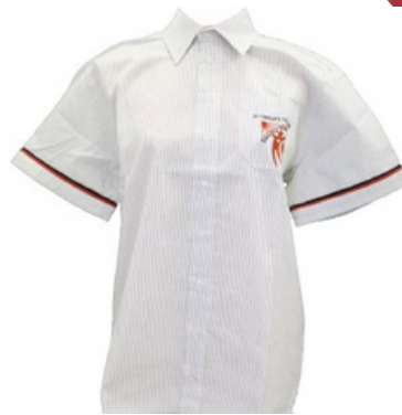
Formal Stripe Shirt